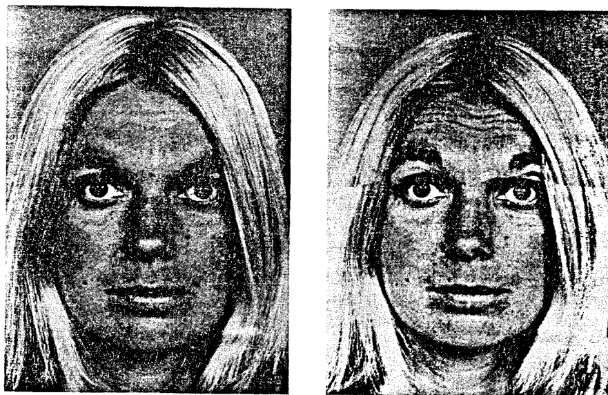
Figure 1 a&b

In his book on expression, Darwin commented on this discovery by Duchenne, including it in his list of reasons why it is so difficult to study expression. 11 More than a hundred years later, before being aware of Duchenne's discovery, we rediscovered and illustrated this point. 12