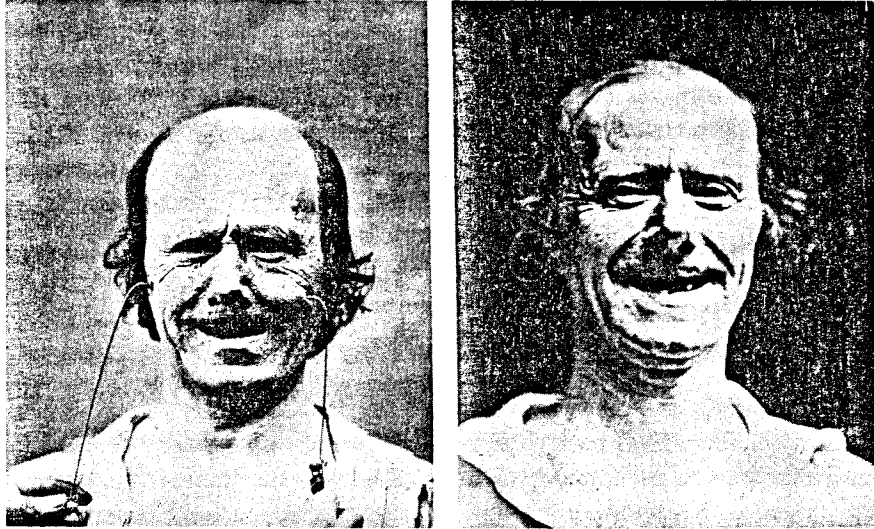
Figure 2 A &amp; B

ample, producing the change in the skin below the lower eyelid, raising the cheeks, and the crows' feet wrinkles – were reliable only when the action of m. zygomaticus major was slight to moderate. When the smiling action produced by m. zygomaticus major was broad, these changes in appearance occurred even without the action of m. orbicularis oculi . With the broad smile it was only the lowering of the brow and the change in the appearance of the eye cover fold that remained as a reliable sign of m. orbicularis oculi activity.