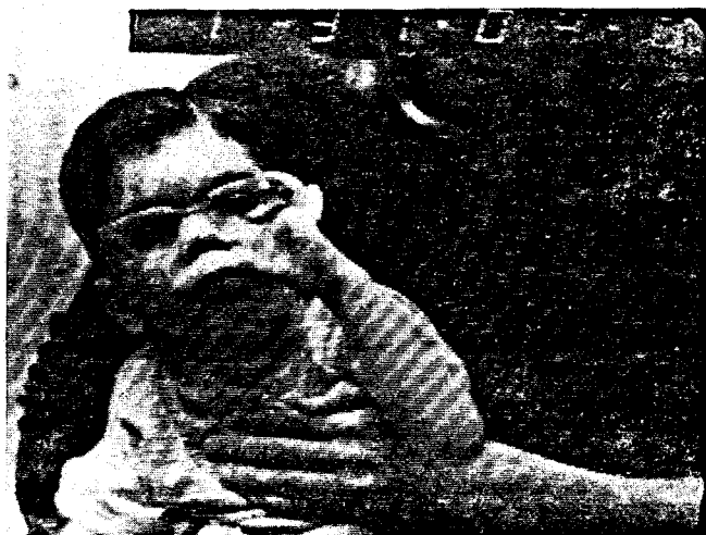
Fig. 4. Hand posturing.