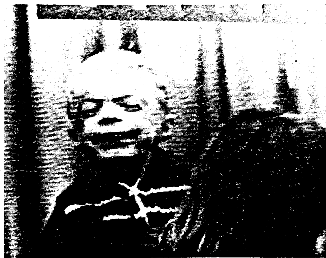
Fig. 3. A smile. The motion that generated it is evident.

In our initial observations, one of the most impressive things about the behavior of the child with the de Lange syndrome was his tendency to arch his back and turn away from an adult who attempted to pick him up and cuddle him (Figs. 1 and 2). Data on