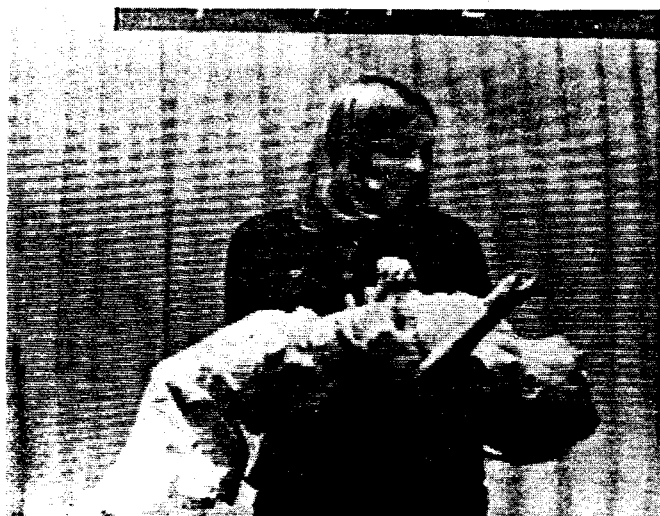
Fig. 1. The de Lange arch in response to being held. The photograph and the next subsequent illustrations were taken off the video monitor to illustrate the technique. The visual time reference is evident.